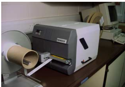
TMS 2000Plus in-line thermal transfer printer