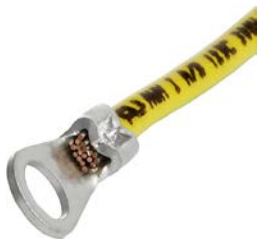
Wire Harness Wire harness for SCHURTER products