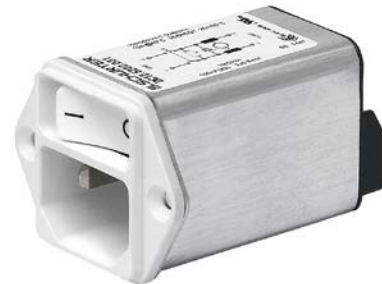
Screw-on mounting from front side, protection class II