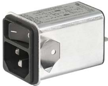
Snap-in version from front side