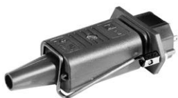
Cord retaining kits Cord retaining strain relief