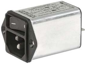
Screw-on mounting from front side