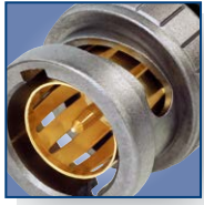
Precise Swiss machined parts