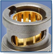
Gold plated contacts