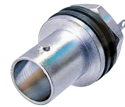
Cable jacks Panel Version – NBB75SI