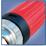
9 different colors available