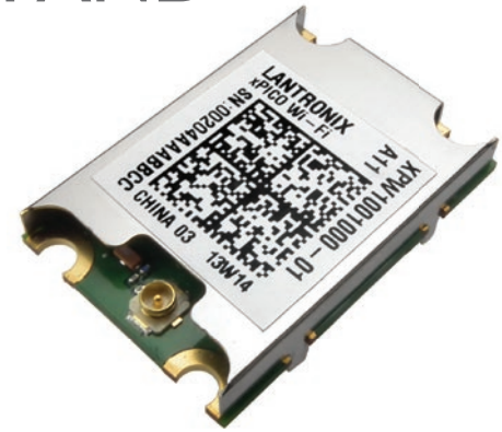
xPico Wi-Fi Actual Size

As one of the smallest embedded device servers in the world, xPico Wi-Fi can be utilized in designs typically intended for chip solutions, befitting in advantages to cost and time-to-market. Its “zero host load” eliminates any need for drivers on the connected microcontroller making implementation easy and fast with virtually no need to write a single line of code. This translates to considerably lower development costs and faster time-to-market. As xPico Wi-Fi meets FCC Class B, UL and EN EMC and safety compliance, your development time is shortened. xPico Wi-Fi can reduce the overall cost of ownership compared to the competition.