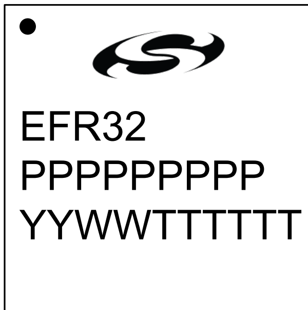
Figure 8.3. QFN32 Package Marking