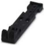
Strain relief, Number of positions: 2, Color: black