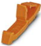
Latching, Number of positions: 1, Color: orange