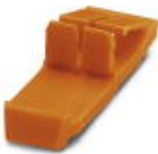
Latching, Number of positions: 2, Color: orange