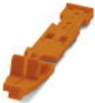
Latching, Width: 5.2 mm, Length: 3 mm, Number of positions: 2, Color: orange