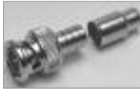
Crimp BNC (M) 2 Piece, Solderless