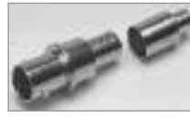
Crimp BNC (F) 2 Piece, UG-89