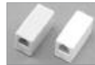
Unshielded Modular In-Line Coupler Cross Wired for Voice Applications.