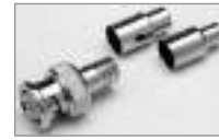
Crimp BNC (M) with (2) Ferrules, 2 Piece. One Connector Two Ferrules to fit Multiple Size Cables.