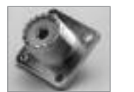
Chassis Mount UHF (F) to Solder Lug, SO-239