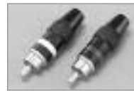
RCA Plug (M) Gold Plated