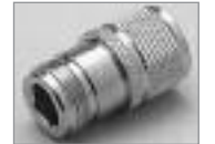
'N' (F) to UHF (M) UG-83/U