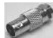
'F' (M) to BNC (F)