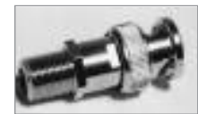
'F' (F) to BNC (M)