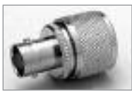
BNC (F) to UHF (M)