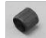
BNC Hood for 3-Piece Crimp Plug Black Only, 100 per bag