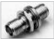
Chassis Mount TNC (F) to TNC (F), 1/2" Mounting Hole