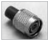
TNC Terminator (M) 0.5W @ 2%