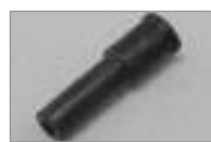
RG-59 Weatherproof Boot Black Only, 100 per bag