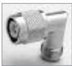
TNC Right Angle TNC (M) to TNC (F)