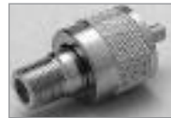
UHF (M) to 'F' (F)