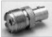
UHF (F) to BNC (F)