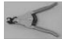
Automatic Wire Stripper Designed for Radio, TV & Computer and Telephone cabling applications to cut and strip insulation automatically.