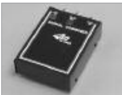
Channel 3 Signal Combiner

Has six-stage bypass/bandstop filter with adjustable balancing attenuators, enabling the use to combine a channel 3 output signal from a STV, MDS, VCR or Video Game device with an existing MATV System containing adjacent channel 2 and 4. The filtering system provides excellent harmonic reduction from all types of modulators used in STV, MDS or VCR units. Individually boxed.