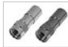
'F' Compression (M) New! Crimp, 1 Piece for Weatherproof Applications (use crimp tool 24-77144P).