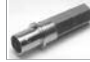
Twist-On BNC (F) 1 Piece, UG-89