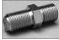
F-81 Inline 1" Splice (F) to (F)