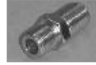
F-81 2GHz 1" Splice for CATV & Satellite (F) to (F)