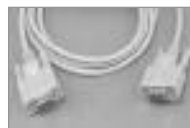
DB9 Extension Cable (F) Wired Pin to Pin