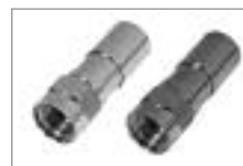
'F' Compression (M) New! Crimp, 1 Piece for Weatherproof Applications (use crimp tool 24-77144P).