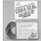
COAX Seal 1/2" x 60" Moldable plastic. Seals fittings from moisture, Sold in 12 packs