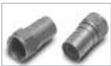
Gel Filled 'F' (M) Crimp, 0.324 Diameter, with O-ring for Weatherproof Application.