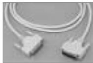
Serial & Parallel Extension Cable 25 Conductor, 28 AWG, Shielded