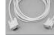
DB9 Data Extension Cable Wired Pin to Pin