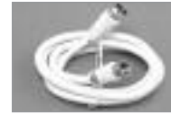
RG-59 Hook-up Cables with Molded Strain Relief 75 Ohm, Packaged for Retail Display.