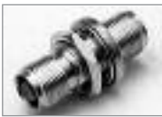
Chassis Mount TNC (F) to TNC (F), 1/2" Mounting Hole