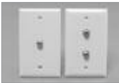
CATV/Satellite Wallplate with 2 GHz F-81 Connector Flush Mount, Plastic