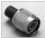
TNC Terminator (M) 0.5W @ 2%