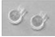
UY Connector Bundle Splice for 2 Wire Connections, for 22-26 AWG Wire.