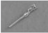
Standard D-Sub Pins for 98 & 99 Series (M) Gold Plated