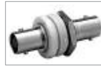
Isolated Dual BNC (F) 1/2" & 5/8" Chassis Mount Hole