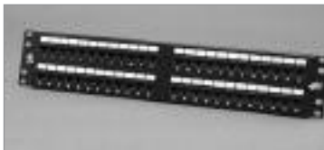
19" Rack Mount Cat5E Patch Panels RJ-45/110 IDC, EIA 568A/B

Each 110 IDC is color coded for EIA 568A & 568B termination, and each panel is individually boxed and includes 110 IDC dust caps, mounting screws, and a disposable 110 IDC termination tool.