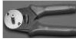
D-Sub Crimping Tool for Precision Machined Contacts , 4 Way Indent, Crimps 20-26 AWG with Built-in Contact Locator.