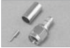
SMA for Flexible Cable (M) Crimp, 3 Piece, Solder or Crimp Center Pin