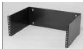
Hinged Wallmount Patch Panel Bracket 12" depth, EIA/TIA Threaded Hole Pattern, Metal, Black