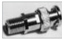
BNC (M) to 'F' (F)