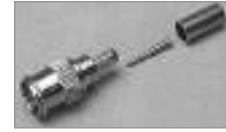
Push-On Mini-UHF (M) Crimp, 3 Piece