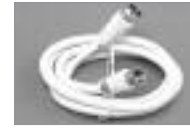
RG-59 Hook-up Cables with Molded Strain Relief 75 Ohm, Packaged for Retail Display.