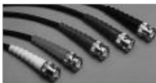
RG-58 Thin Ethernet BNC to BNC Cables Constructed of 50 Ohm, 95% Braid & 100% Foil Shield Cable, 20 AWG Stranded (Belden 9907 Equivalent), Black PVC Cable.