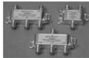
CATV Digital Ready Splitters Horizontal, 5 MHz to 1 GHz

Features solder sealed back plate providing 130db RF shielding, a printed circuit design that ensures performance up to 1 GHz, and a specially plated Zinc housing and 360° port sealing sleeves allow for excellent corrosion resistance. Port spacing allows for easy installation of security shields, and each comes complete with a grounding screw.