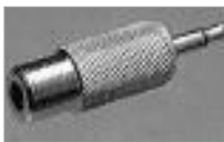
'F' (F) to P3.5 mm (M)