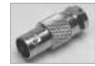
BNC (F) to 'F' (M)