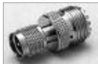
Mini-UHF (M) to Mini-UHF (F)