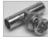
BNC 'T' Adapter 1 Male - 2 Female (F-M-F), UG-274/U