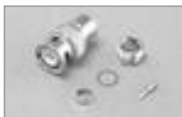
Screw-On BNC (M) Solder, 6 Piece