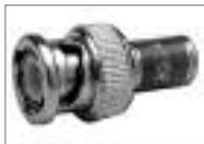
BNC Terminators 1/2 W @ 1%, with and without Grounding Strap