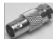
'F' (M) to BNC (F)