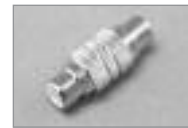
Inline Adapter, Metal RCA (F) to RCA (F) Gold Plated