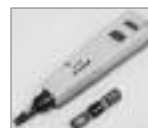
Pro-Series Impact Punch Down Tool Has a 66 & 110 Blade, a Twist Lock Mechanism, and Adjustable Impact Control.