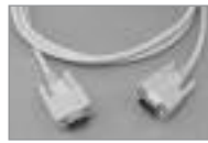
VGA/SVGA Multi-Coax Monitor Cable