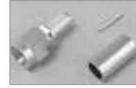
SMA (M) Crimp, 3 Piece, Solder or Crimp Center Pin