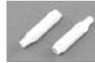
B-Wire Connector Splices 17 AWG Bare and 22 AWG Insulated Wire.