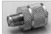
Mini-UHF (F) to UHF (M)