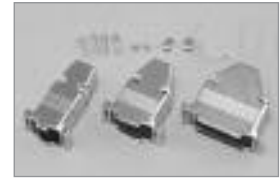
Shielded Metal 'HM' Series D-Sub Hoods includes Hardware, Silver.