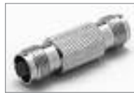
TNC Inline Splice TNC (F) to TNC (F)