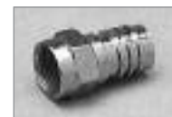
Crimp-On F-56ALM (M) for RG-6 Cable, Zinc Plated.