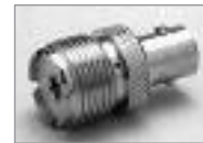
BNC (F) to UHF (F)