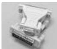
Gender Adapter DB9 (F) to DB25 (M)