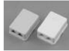
Dual Cat4 RJ-45 Surface Box 4 or 8 Conductor Screw Termination