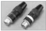
RCA Jack (F) Gold Plated