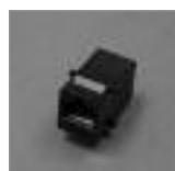
Unshielded Cat 4 RJ-45 Keystone Feed Through Adapter Black