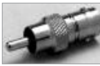
BNC (F) to RCA (M)