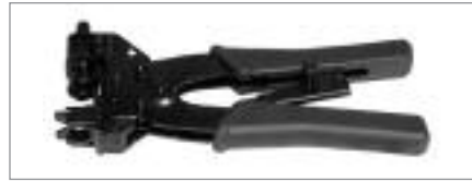
All-In-One Adjustable Ratchet Crimp Tool for all types of BNC, F and RCA Compression Connectors