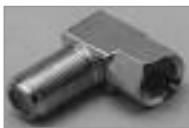
'F' (F) Right Angle to 'F' (M)