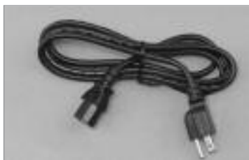
Three Conductor Electrical Equipment Cords Use with Computer Monitors, Printers, Peripheral Devices & other Electronic Equipment, 7 Amp 125 V, 18 AWG.