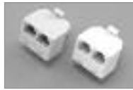
Unshielded Modular Duplex Adapter for splitting Voice, Modem, Fax and Data Lines.