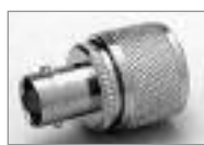
UG-273/U Adapter UHF (M) to BNC (F)