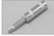
1/4" Mono Plug (M) Metal