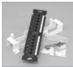
Vertical Wall Mount w/Bracket RJ-45/110 IDC, EIA 568A/B