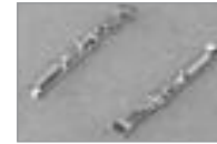
High Density D-Sub Pins for 98 & 99 Series (F) Gold Plated