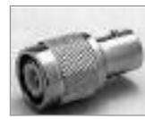
BNC (F) to TNC (M)