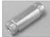
Inline Splice 'N' (F) to 'N' (F), UG-29B/U