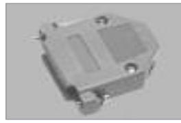
Deluxe Plastic 'HX' Series D-Sub Hoods includes Mounting Hardware & Set Screw to Hold Cable, Gray.