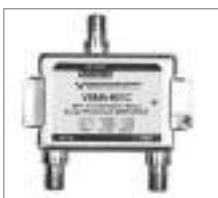
Mini Drop Amplifier 54 MHz to 1 GHz (Boxed)

This compact digital ready amplifier is designed for restricted spaces and drop boxes, and features 6 KV combination wave surge protection, triple plated Zinc housing for maximum corrosion protection, precision machined brass 'F' Connectors and an Internal Diplexor for increased band isolation. Power Adapter included.