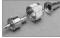
Crimp UHF (M) 3 Piece