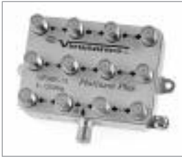
CATV Platinum Plus Splitter Vertical, 5 MHz to 1 GHz

Features solder sealed back plate providing 130db RF shielding, a printed circuit design that ensures performance up to 1 GHz, and a specially plated Zinc housing allows for excellent corrosion resistance. Port spacing allows for easy installation of security shields, and each comes complete with a grounding screw.