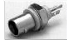
Isolated BNC (F) 3/8" Chassis Mount Hole