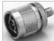
SMA (F) to 'N' (M)