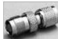
TNC (F) to Mini-UHF (M)