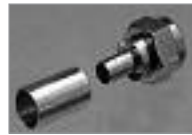
Crimp-On F-59 (M) with Separate 1/2" Ring.