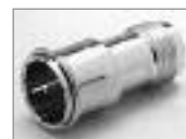
TNC (F) to Push-On TNC (M) 1 Piece