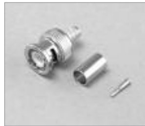
Crimp BNC (M) 3 Piece