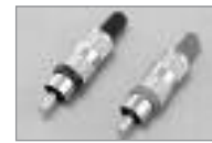
RCA Plug (M) Metal