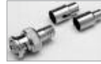
Crimp BNC (M) with (2) Ferrules, 2 Piece. One Connector Two Ferrules to fit Multiple Size Cables.