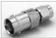
SMA (M) to BNC (F)