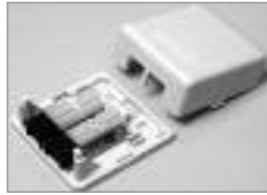
Category 5E Surface Mount Boxes PC Board Design, RJ-45/110 IDC, EIA 568A & 568B Termination, Plastic Housing