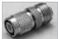
TNC (M) to UHF (F)