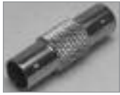
In-Line Splice BNC (F) to BNC (F), UG-914/U