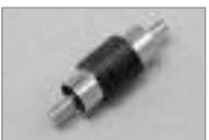
Inline Adapter RCA (M) to RCA (M) Gold Plated