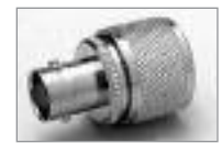
BNC (F) to UHF (M)