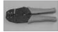
Insulated Terminal Ratchet Crimping Tool Crimps 10-22 AWG fully insulated terminals in an ovalized crimp.

Blister No. 24-8622P Replacement Die No. 99-8622