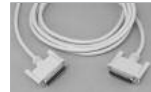
DB25 Data Switch Cable 25 Conductor, 28 AWG, Shielded