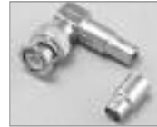
Right Angle, Crimp BNC (M) 2 Piece, Solderless