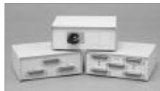
D-Sub Manual Data Switches Rotary Switch, 2-amp capacity, No AC Required, Boxed, Metal