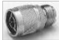
'N' (M) to UHF (F) UG-146/U