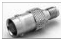
SMA (F) to BNC (F)