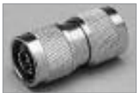
Inline Splice 'N' (M) to 'N' (M), UG-57B/U