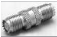
Mini-UHF (F) to Mini-UHF (F)