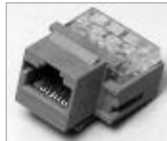
90° Cat3 Tool-less Keystone USOC Jacks (Voice - 6p6c)