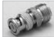
BNC (M) to UHF (F)