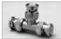
BNC 'T' Adapter 3 Male (M-M-M)