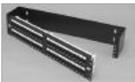
Hinged Wallmount Patch Panel Bracket 5" depth, EIA/TIA Threaded Hole Pattern, Metal, Black