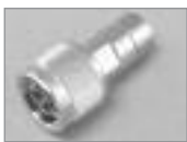
'N' Terminator (M) 1W @ 2%