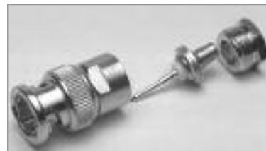
Solder or Crimp BNC (M) 3 Piece