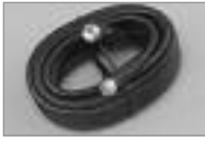
F-59 Hook-Up Cable with Gold Connectors Molded Strain Relief, 75 Ohm, Packaged for Retail Display.