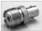
UHF (F) to BNC (F)