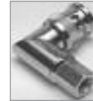
Right Angle, Twist-On BNC (M) 1 Piece, Solderless