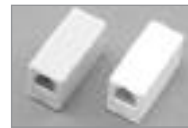
Unshielded Modular In-Line Coupler Cross Wired for Voice Applications.