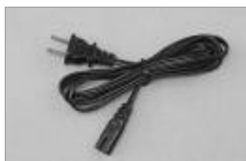
Panasonic Replacement AC Power Cords, 6 ft.