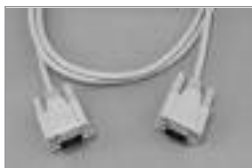
DB9 Data Switch Cable Wired Pin to Pin