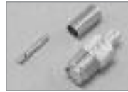
Mini-UHF (F) Crimp, 3 Piece