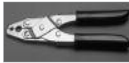
Standard Crimping Tool for RG-6 & RG-59. Economy packaged in non-retail box.