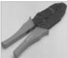
Universal Ratchet Crimping Tool for BNC, TNC & Mini UHF. Five crimp sizes for Pins & Connector Ferrules. Crimps 2 & 3 piece Connectors. Features adjustable crimp pressure and quick release safety latch.