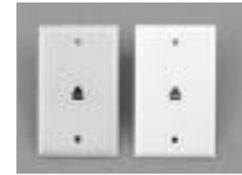
Single Port Category 4 Telephone Wallplate Smooth Finish