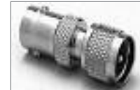
Mini-UHF (M) to BNC (F)