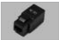
Unshielded Cat5e Panel Mount RJ-45 Modular In-Line Coupler Wired Straight for Data Applications.