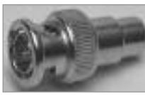
BNC (M) to RCA (F)