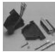
Color: Black Built to Nevada Western Color Code