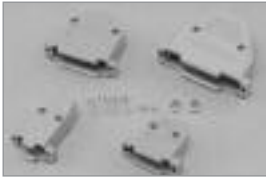
Standard Plastic 'H' Series D-Sub Hoods includes Mounting Hardware, Gray.