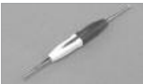
Standard D-Sub Insertion & Extraction Tool