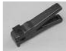
2-Step Cable Stripper with adjustable replacement blades for RG-6, 58, 59 & 62. Poly bagged.