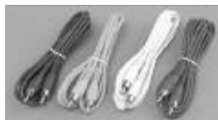
RG-59 Audio & Video RCA to RCA Cables Constructed of RG-59, 75 Ohm, 80% Braid, 22 AWG Stranded Cable, Matching Colored Boots & Cable.