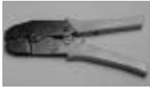
D-Sub Full Cycle Ratchet Crimping Tool Crimps 10-22 AWG Non-Insulated Open Barrel Connectors, D-Sub & V.35 Contacts.

Blister No. 24-8644P Replacement Die No. 99-8644