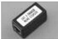
Shielded Cat5e RJ-45 Modular In-Line Coupler Straight Wired