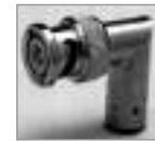
Right Angle BNC (F) to BNC (M)