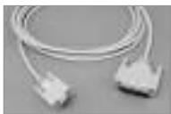
External Serial Modem Cable