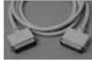
Centronics Printer Cable 36 Conductor, 28 AWG, Shielded