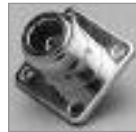
Chassis Mount 'N' (F) to Solder Lug UG-58B/U