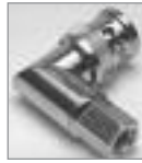
Right Angle, Twist-On BNC (M) 1 Piece, Crimpless & Solderless