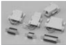
Color: Gray Built to USOC Color Code