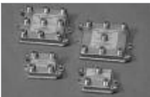
CATV Digital Ready Splitters Vertical, 5 MHz to 1 GHz

Features solder sealed back plate providing 130db RF shielding, a printed circuit design that ensures performance up to 1 GHz, and a specially plated Zinc housing and 360° port sealing sleeves allow for excellent corrosion resistance. Port spacing allows for easy installation of security shields, and each comes complete with a grounding screw.