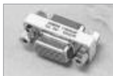
High Density D-Sub (SVGA) Mini Gender Changers & Port Saver