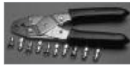
Standard Crimping Tool for RG-6 & RG-59. Includes (10) No. 25-7050 'F-59A' Connectors with attached 1/8" Ring.