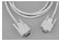
VGA/SVGA Multi-Conductor Extension Cable