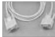
DB9 Extension Cable (F) Wired Pin to Pin