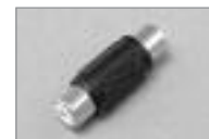
Inline Adapter, Plastic RCA (F) to RCA (F) Gold Plated