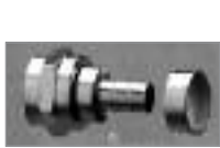
Crimp-On F-59 (M) with Separate 1/8" Ring.

(Use 24-7710 or 24-8866P for the following connectors)