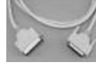
Centronics Printer Cable 25 Conductor, 28 AWG, Shielded