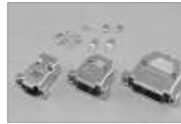
Deluxe Metalized 'HS' Series D-Sub Hoods includes Mounting Hardware, Shield Coating, Silver.