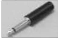
1/4" Mono Plug (M) Plastic