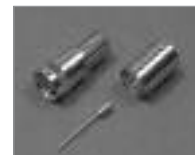
Crimp-On F-11 (M) 3 Piece, for Teflon/Plenum RG-11 Cable.

Part No. Cable Type Tool No. 25-7191 (CPF11ALM) RG-11 24-7711P