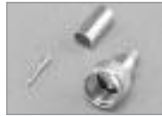
Mini-UHF (M) Crimp, 3 Piece