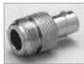
'N' (F) to BNC (F) UG-606/U