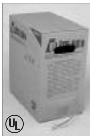
Cat5E & Cat6 Stranded Patch Cable 4 pair, 24 AWG Unshielded, EIA/TIA 568, 1,000 ft. "Reel in Box" with cable length markings.