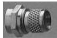
Twist-On F-59TW (M) for Standard RG-59 Cable.