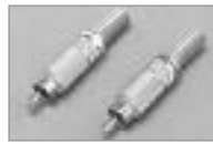
RCA Plug (M) Gold Plated