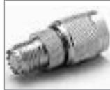
Mini-UHF (F) to TNC (M)