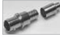
Crimp BNC (F) 2 Piece, UG-89