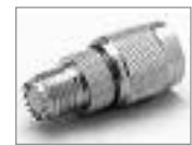
TNC (M) to Mini-UHF (F)