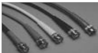
RG-59 Audio & Video BNC to BNC Cables Constructed of RG-59, 75 Ohm, 80% Braid, 22 AWG Stranded Cable, Matching Colored Boots & Cable.

As part of the Emerson Network Power Connectivity Solutions, we offer a wide selection of quality cables and jumpers in most connector styles and lengths. With production capabilities in USA, Mexico and Asia, we offer our customers the flexibility of quick turn assembled and molded cables in all styles and configurations, including Cat5E/6 jumpers, telco cables, Coaxial LAN, D-Sub, Audio/Video cables and many more.