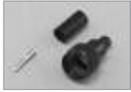
Mini-UHF (M) Crimp, 3 Piece, Black