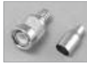
Crimp TNC (M) 2 Piece, Non-Solder Center Pin