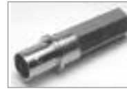
Twist-On BNC (F) 1 Piece, UG-89