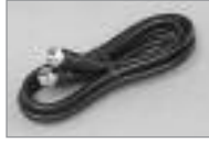
F-59 Hook-Up Cable with Molded Strain Relief 75 Ohm, Bulk Packaged.