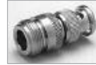
'N' (F) to BNC (M) UG-349/U