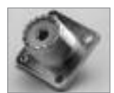
Chassis Mount UHF (F) to Solder Lug, SO-239