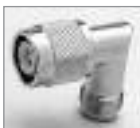
TNC Right Angle TNC (M) to TNC (F)