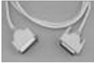
IEEE 1284 Centronics Printer Cable 18 Pair, 28AWEG, Dual-Shielded