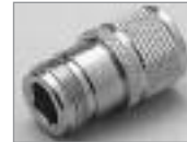
'N' (F) to UHF (M) UG-83/U