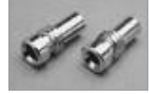
UG-175 Reducer Used with a PL-259