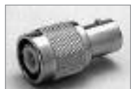
TNC (M) to BNC (F)