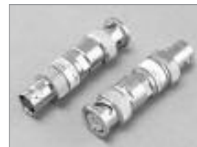
BNC (M) to BNC (F) Attenuator Pads 1/2 W @ 5%, 50 Ohms