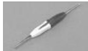
High-Density D-Sub Insertion & Extraction Tool