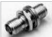
Chassis Mount TNC (F) to TNC (F), 1/2" Mounting Hole