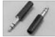
1/4" Stereo Plug (M) Plastic