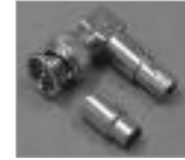
Right Angle, Crimp BNC (M) 2 Piece, Solderless