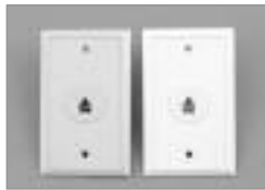
Single Port Cat 4 Voice & Data Wallplates Standard Finish