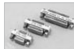
D-Sub Mini Gender Changers