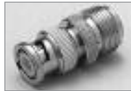
UG-255 Adapter UHF (F) to BNC (M)