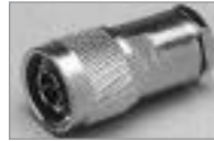
'N' (M) Solder Center Pin, UG-21B/U