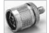
'N' (M) to SMA (F)