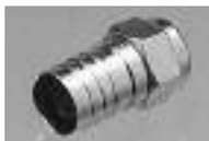
Crimp-On F-56ALM (M) for RG-6 Cable.