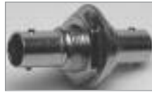
Dual BNC (F) 1/2" Chassis Mount Hole, UG-492