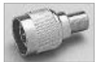
'F' (F) to 'N' (M)