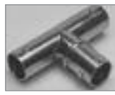
BNC 'T' Adapter 3 Female (F-F-F)