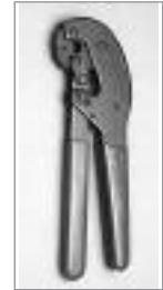
'F' Deluxe Hex Crimp Tool for RG-6 & 59.