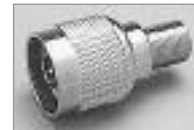
'N' (M) to 'F' (F)