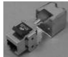
Shielded CAT5E RJ-45 Keystone Jacks (8p8c)