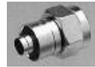
Crimp-On F-59A (M) with Attached 1/8" Ring.