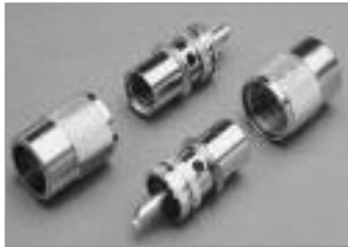
UHF (M) Solder, 2 Piece, PL-259