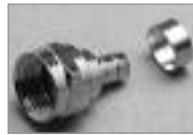
Crimp-On Gold Plated F-59 (M) with Separate 1/8" Ring.