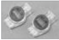
UR Connector 3 Ports for 2 or 3 Wire Connections, for 19-26 AWG Wire.