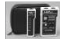
LANtest Remote Cable Tester Tests Pinout & Continuity for 4,6 & 8 pin USOC, RJ-45 568 A&B and Thinnet BNC Connections.