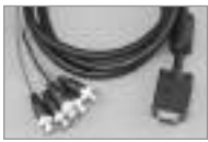
VGA/SVGA Multi-Coax 5 BNC Monitor Cable