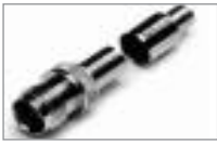
Crimp TNC (F) 2 Piece, Non-Solder Center Pin