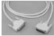
Serial & Parallel Extension Cable 25 Conductor, 28 AWG, Shielded