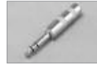
1/4" Stereo Plug (M) Metal