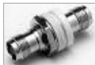
Isolated Chassis Mount TNC (F) to TNC (F), 1/2" & 5/8" Mounting Hole