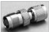
Mini-UHF (M) to TNC (F)