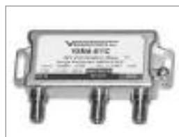
Single Sided Mini Drop Amplifier 54 MHz to 1 GHz (Boxed)

This compact digital ready amplifier has all ports on one side for use in restricted spaces and drop boxes, and features 6 KV combination wave surge protection, triple plated Zinc housing for maximum corrosion protection, precision machined brass 'F' Connectors and an internal Diplexor for increased band isolation. Power Adapter included.