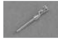
High Density D-Sub Pins for 98 & 99 Series (M) Gold Plated