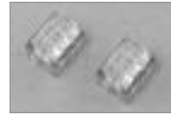
UB Connector Space Saving Tap Connector to tap into existing wire without interruption, for 22-26 AWG Wire.