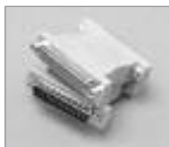
Null Modem Adapter DB25 (M) to DB25 (F)