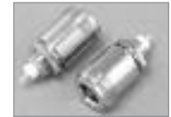
Chassis Mount 'N' (F)