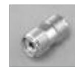
UHF (F) to 'F' (M)