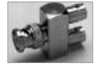
BNC Goalpost 'T' Adapter 1 Male - 2 Female (F-M-F)