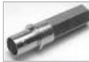
Twist-On BNC Jack (F) 1 Piece, Field Installable