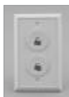
Dual Port Cat 4 Voice & Data Wallplates Standard Finish