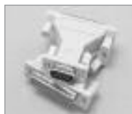
Gender Adapter DB9 (M) to DB25 (F)