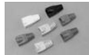
Colored Snagless Boots for RJ-45 8 Conductor Shielded and Unshielded Modular Plugs.