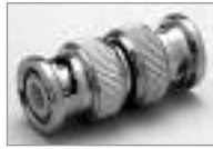
BNC (M) to BNC (M)