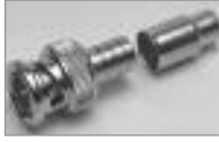
Crimp BNC (M) 2 Piece, Solderless