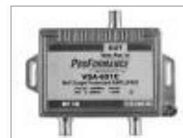
Digital Ready Drop Amplifier 54 MHz to 1 GHz (Boxed)

This full-size Amplifier features 6 KV combination wave surge protection, triple plated Zinc housing for maximum corrosion protection, diecast Zinc plated 'F' Connectors and an Internal Diplexor for increased band isolation. Power Adapter included, and available with or without Power Inserter. Power Adapter included.