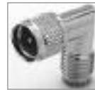
Right Angle Adapter Mini-UHF (M) to Mini-UHF (F)