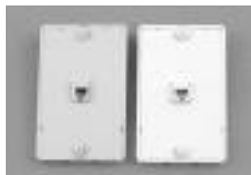
Wallmount Telephone RJ-11 Wallplate