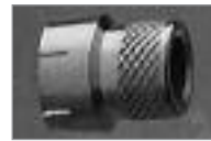
Twist-On F-59TW (M) for RG-59 with Male Quick Disconnect.