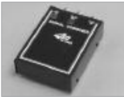
Channel 3 Signal Combiner

Has six-stage bypass/bandstop filter with adjustable balancing attenuators, enabling the use to combine a channel 3 output signal from a STV, MDS, VCR or Video Game device with an existing MATV System containing adjacent channel 2 and 4. The filtering system provides excellent harmonic reduction from all types of modulators used in STV, MDS or VCR units. Individually boxed.