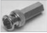
Twist-On BNC (M) Piece, Crimpless & Solderless