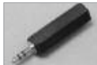
1/4" Stereo Jack (F) to 3.5 mm Plug (M)