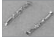
Standard D-Sub Pins for 98 & 99 Series (F) Gold Plated