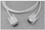
VGA/SVGA Multi-Conductor Video Cable