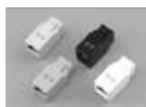
Unshielded Cat 5e RJ-45 Keystone Feed Through Adapter