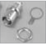
Solder to BNC (F) 3/8" Mounting Hole, UG-1094U