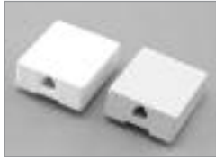
Single Port Surface Mount Box Category 4 Screw Termination, Bottom Entry Wiring