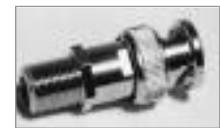
'F' (F) to BNC (M)