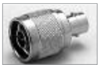
'N' (M) to BNC (F) UG-201U