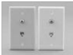
Dual Port Telco & CATV Wallplate RJ-11 & F-81, Standard Finish