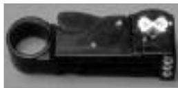
3-Step Cable Stripper with adjustable replacement blades for standard & Teflon RG-59, RG-6 & Belden 8281.