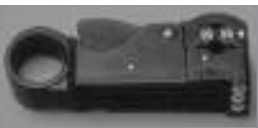
3-Step Cable Stripper with adjustable replacement blades for standard & Teflon RG-58, 59 & 62.