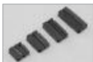
Dual Row Socket Connectors - Headers (0.01" x 1" Spacing w/Strain Relief)