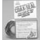
COAX Seal 1/2" x 60" Moldable plastic. Seals fittings from moisture, Sold in 12 packs