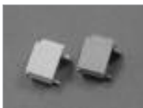
Keystone Blank Filler Insert