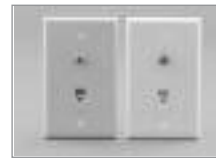
Dual Port Telco & CATV Wallplate RJ-11 & F-81, Flush Mount, Plastic