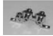
CATV F-81 Grounding Blocks Zinc diecast, includes 2 mounting screws.