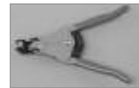
Automatic Wire Stripper Designed for Radio, TV & Computer and Telephone cabling applications to cut and strip insulation automatically.