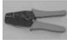
D-Sub Full Cycle Ratchet Crimping Tool with Tension Adjustment Wheel , crimps 18-22 & 24-30 AWG, Non-Insulated Open Barrel Connectors, D-Sub Contacts.

Blister No. 24-8644P Replacement Die No. 99-8644