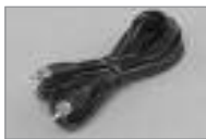
RCA (STEREO) Hook-Up & Dubbing Cables Molded Strain Relief, Shielded 75 Ohm, Red & White Color Coded, Packaged for Retail Display.