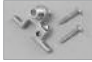
CATV F-81 Grounding Blocks Zinc diecast, includes 2 mounting screws.