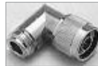
Right Angle 'N' (M) to 'N' (F), UG-27/U