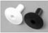
Plastic Feed Thru Bushings