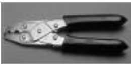
Economy Hex Crimping Tool for RG-6 & RG-59. Economy packaged in non-retail box.