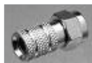
Twist-On F-56 (M) for standard RG-6 Cable.