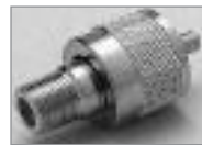
UHF (M) to 'F' (F)