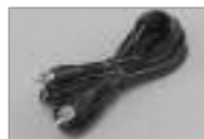
RCA (AUDIO) Hook-Up Cables Molded Strain Relief, Shielded 75 Ohm, Packaged for Retail Display, Black.