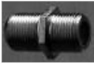
F-81 Inline 3/4" Splice (F) to (F)