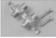
Satellite & CATV Grounding Blocks with Brass F-81 connectors and Zinc diecast block, includes 2 mounting and grounding screws.