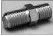
F-81 Inline 1" Splice (F) to (F)