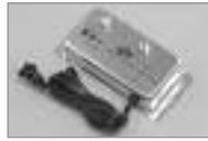
1 Way 30db TV/VCR Amplifier with Adjustable Gain 54 MHz to 900 MHz (Boxed)