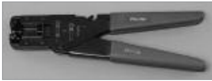
Compression Crimp Tool For RG-59 & RG-6 Snap-N-Seal® compatible 20.3mm (F) Connectors..