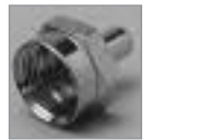
F-59T (M) Terminator 1/2 Watt @ 5%