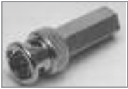
Twist-On BNC (M) Piece, Crimpless & Solderless