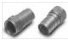
F-56ALM WP (M) Crimp, 1 Piece, 0.324 Diameter, Chromate Plated, with Interior Gasket.