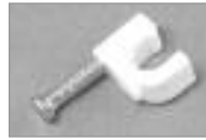
Plastic Cable Clips with Mounting Nail.