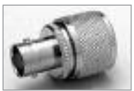
BNC (F) to UHF (M)