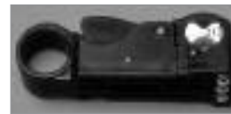
3-Step Cable Stripper with non-adjustable replacement blades RG-8, 11 & 213.