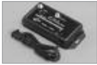
1 Way 25db TV/VCR Amplifier 54 MHz to 900 MHz (Boxed)

Covers Mid & Super Bands 54 to 90 MHz, switchable FM Trap, 75 Ohm Input & Output, uses 110VAC Power Source, has built-in lightning protection, constructed with a heavy metal case, On/Off Light and a Low Noise-Integrated Circuit.