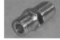
F-81 2GHz 1" Splice for CATV & Satellite (F) to (F)