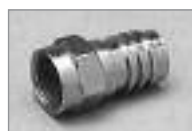
Crimp-On F-56 (M) for Teflon/Plenum RG-6 Cable.