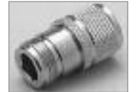
'N' (F) to UHF (M) UG-83/U