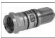
'F' Mini-Attenuator Pads Nickel Plated, Accuracy within 5%, Return Loss 20db, 22 AWG Center Pin, DC to 1 GHz Bandwidth, (M) to (F)