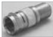
'F' Voltage Blocking Coupler Blocks DC and Low Frequency AC Power-Bandwidth: DC to 1 GHz, Return Loss 25db, (M) to (F)