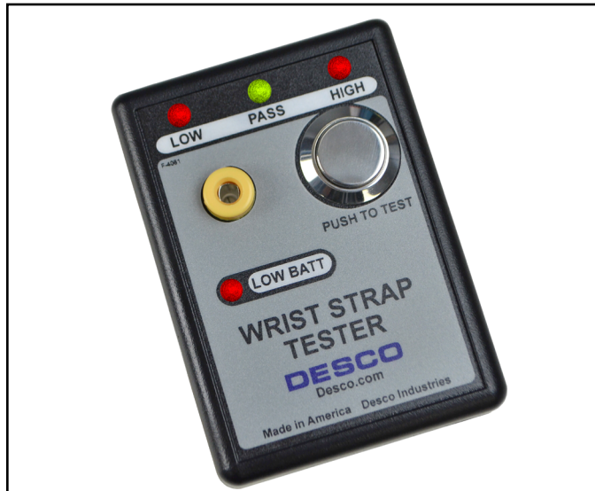
Figure 1. Desco 19240 Portable Wrist Strap Tester