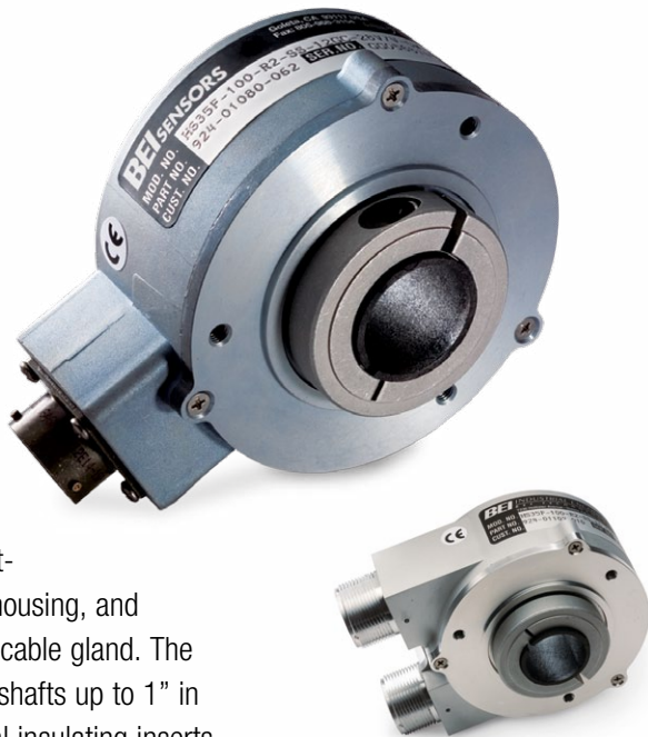
The HS35 Dual Output Encoder

The HS35 combines the rugged, heavy-duty features usually associated with shafted encoders into a hollow shaft style. Its design includes dual bearings and shaft seals for NEMA 4, 13 and IP65 environmental ratings, a rugged metal housing, and a sealed connector or cable gland. The HS35 accommodates shafts up to 1" in diameter. With optional insulating inserts, it can be mounted on smaller diameter shafts. It can be mounted on a through shaft or a blind shaft with a closed cover to maintain its environmental rating. The HS35 is also available with a dual output option (inset) to provide redundant encoder signals, dual resolutions, or to supply two separate controllers from a single encoder. Applications include motor feedback and vector control, printing industries, robotic control, oil service industries, and web process control.