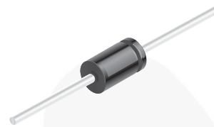
DO-41 (Plastic) COLOR BAND DENOTES CATHODE