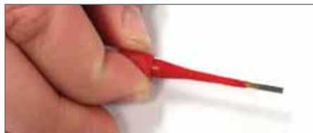
Plastic tool with contact in proper position.