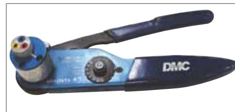
Example M22520 Series Crimping Tool for size 20, 16 or 12 contacts, and has a positioner that can be dialed for each contact size.

** Min. diameters to ensure moisture proof assembly; max. diameters to permit use of metal removal tools.